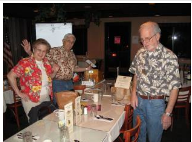
All you have to do is ask and people get all dressed up for the occasion! What a crazy GREAT group!