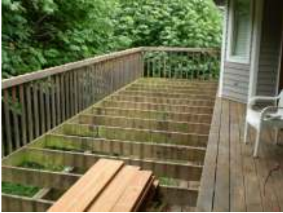
Deck after Lion Steve had ripped off all the bad stuff.