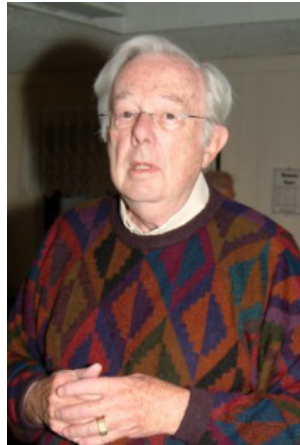
Our new Branch Liaison says: 'See you all on November 12!'