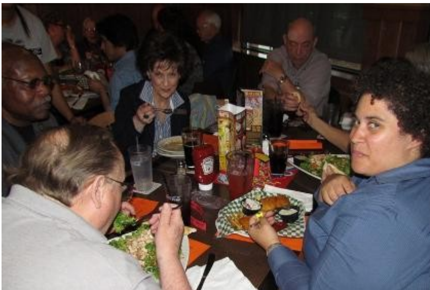
Another "Fun Table" enjoys the meeting and meal.